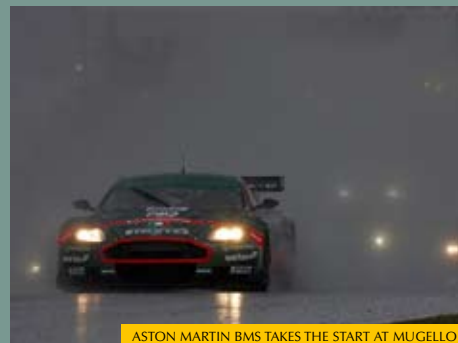
ASTON MARTIN BMS TAKES THE START AT MUGELLO