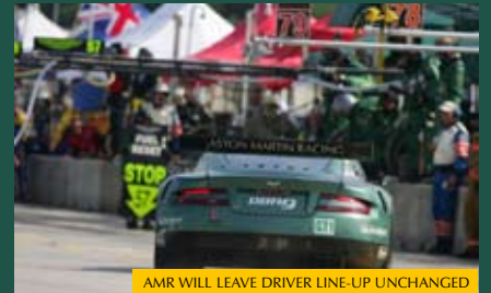
AMR WILL LEAVE DRIVER LINE-UP UNCHANGED