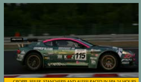
GROPPI, SEILER, STANCHERIS AND ALESSI RACED IN SPA 24 HOURS