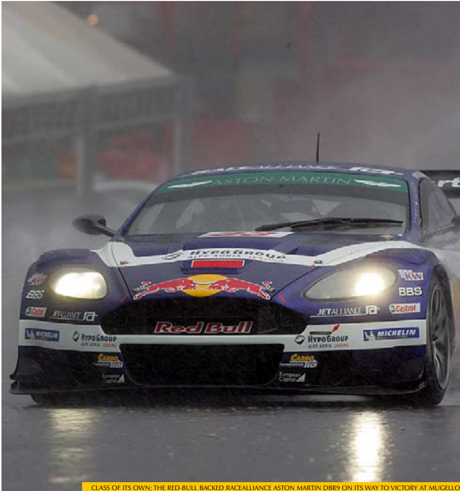
CLASS OF ITS OWN; THE RED-BULL BACKED RACEALLIANCE ASTON MARTIN DBR9 ON ITS WAY TO VICTORY AT MUGELLO

| ISSUE 19 | www.astonmartinracing.com |