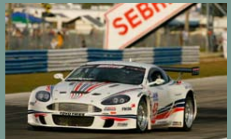
THE AUTOSPORT DESIGNS RACING DBRS9 ON ITS COMPETITION DEBUT

The Autosport Designs Racing team will contest the full 10-round SCCA Speed GT World Challenge with the two Aston Martin DBRS9s. The next round is in St Petersburg, Florida, on April 2.