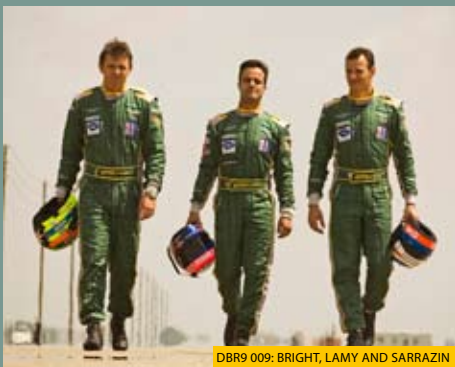
DBR9 009: BRIGHT, LAMY AND SARRAZIN

If I don't feel competitive then I will stop, but I would like to be racing until I am 50 years old!