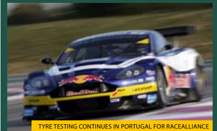
TYRE TESTING CONTINUES IN PORTUGAL FOR RACEALLIANCE