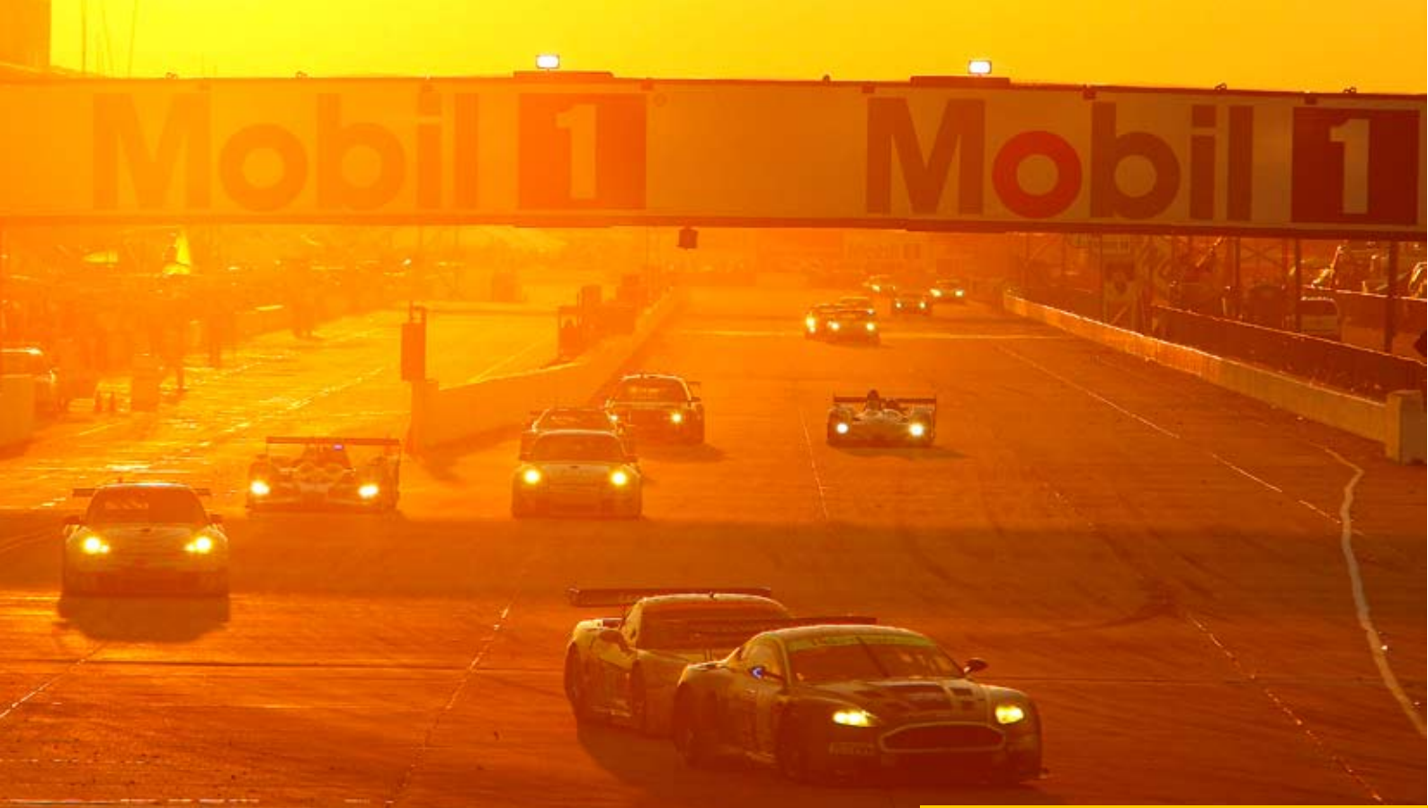
AS THE SUN SETS, ASTON MARTIN HEADS A TRAIN OF CARS INTO SEBRING'S FAMOUS TURN ONE