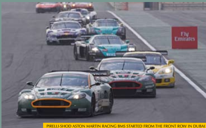
PIRELLI-SHOD ASTON MARTIN RACING BMS STARTED FROM THE FRONT ROW IN DUBAI

The relationship with Aston Martin was new at the start of the season and it took time to develop into a race-winning package.