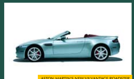
ASTON MARTIN'S NEW V8 VANTAGE ROADSTER

Aston Martin's V8 Vantage Roadster will be launched at the Los Angeles Motorshow on November 28. It is the latest addition to the Vantage family which includes production models adapted for racing. The N24 racing car, which contested the Nurburgring 24-hours in June, is currently in transit to Bahrain to contest the Bahrain 24-hours on December 15-16.