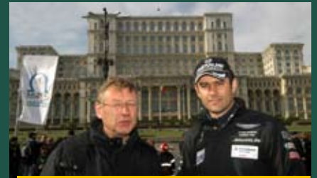
KARL WENDLINGER (RIGHT) WITH HERMANN TILKE IN BUCHAREST

RaceAlliance Aston Martin driver Karl Wendlinger and circuit designer Hermann Tilke attended a presentation at the Bucharest circuit prior to its debut FIA GT Championship race on May 20, 2007. Around 20,000 Romanian spectators turned out for the ceremony and Wendlinger gave passenger rides around a specially constructed section of the 3.1km circuit.