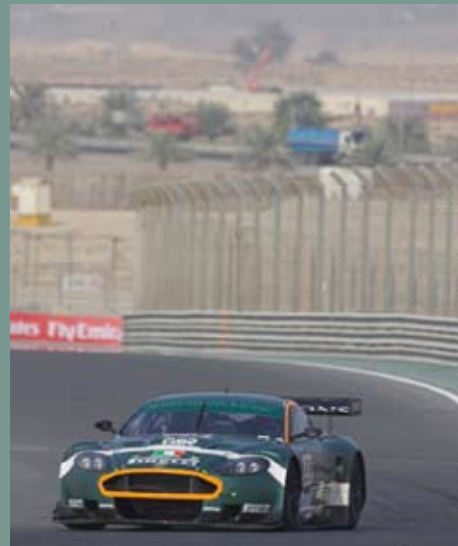
FABIO BABINI SET POLE POSITION TIME IN THE NUMBER 23 DBR9